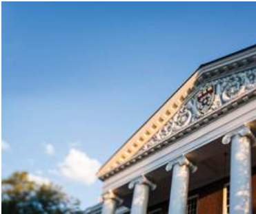
Our comprehensive leadership programs turn executives into visionaries (HBS Executive Education)