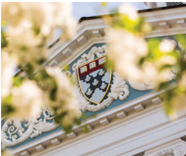
Taught by renowned, full-time Harvard Business School faculty members (HBS Executive Education)