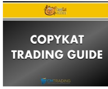
Social trading: a shortcut to investment profits in currency markets (CM Trading)