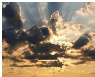
How are protectionist policies affecting emerging markets? (MarketViews)