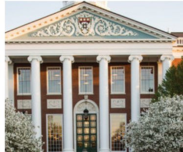
Learn more about the Certificate of Management Excellence (HBS Executive Education)